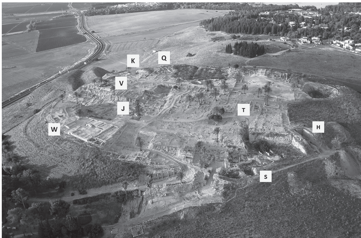
Fig. 1.2: Areas excavated in 2010–2014, looking south.

* × Refers to discussion of entire dig in the given area.