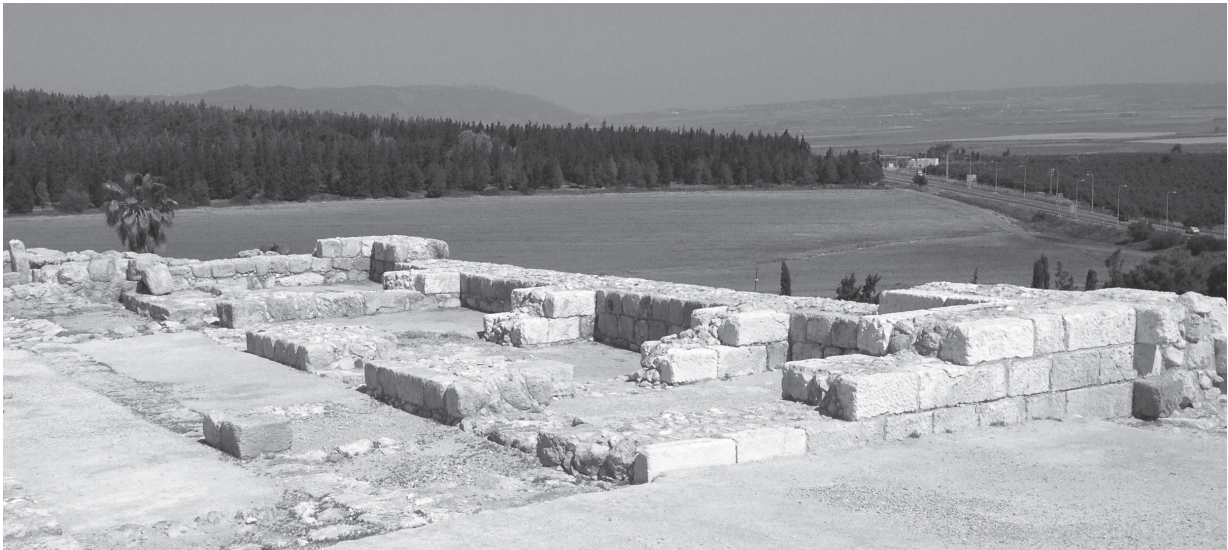
Fig. 1.7: Palace 6000 and northern stables after preservation and restoration by the National Parks Authority.