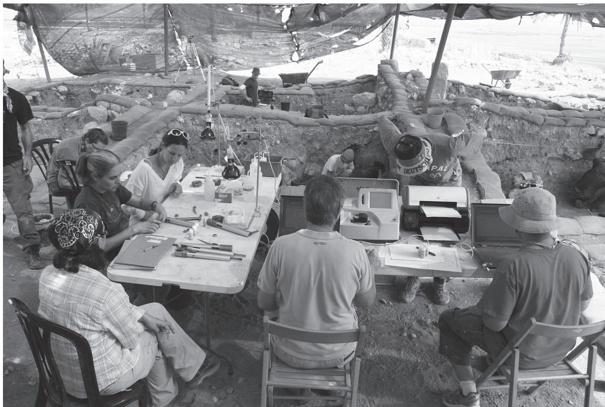
Fig. 1.3: Microarchaeology laboratory in the field in Area Q, 2010.