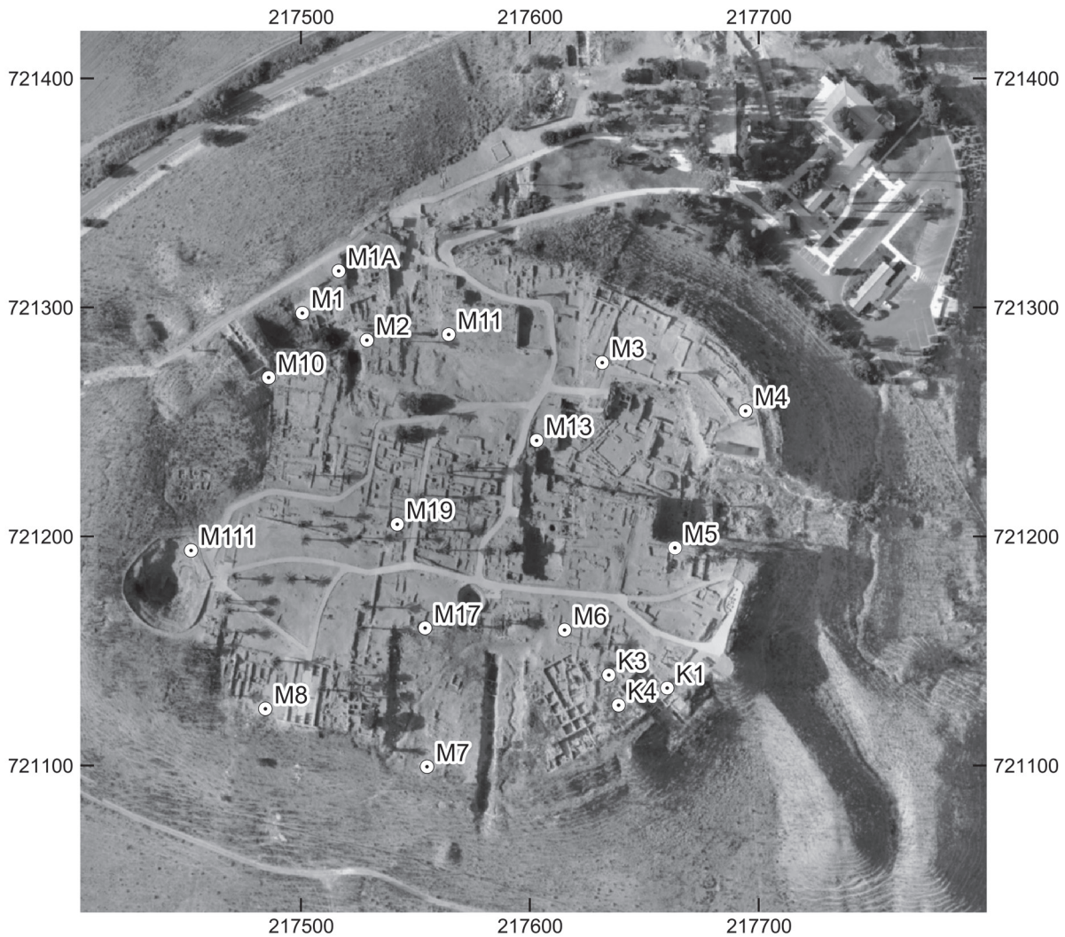
Fig. 1.9: Map indicating newly established fix points.

The data obtained from the total stations augment the data structure that has been in use since the first main season in 1994 (for the Megiddo digital recording system, see Benenson and Finkelstein 2000; Zapassky and Benenson 2006). Our database has been slightly adapted; the newly recorded points were