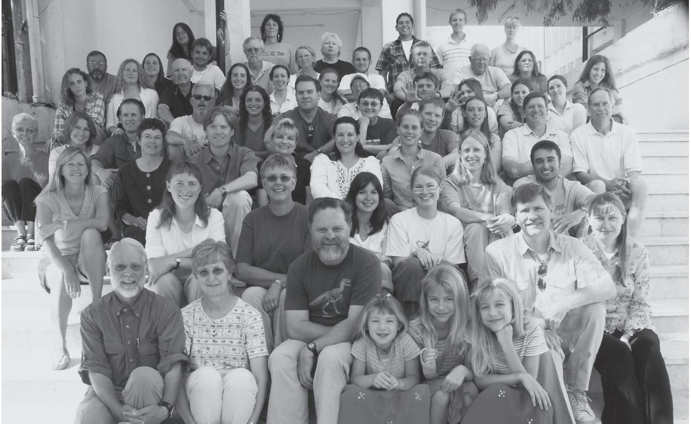
Figure 1.2. The 2006 Madaba Plains Project 'Umayri team.