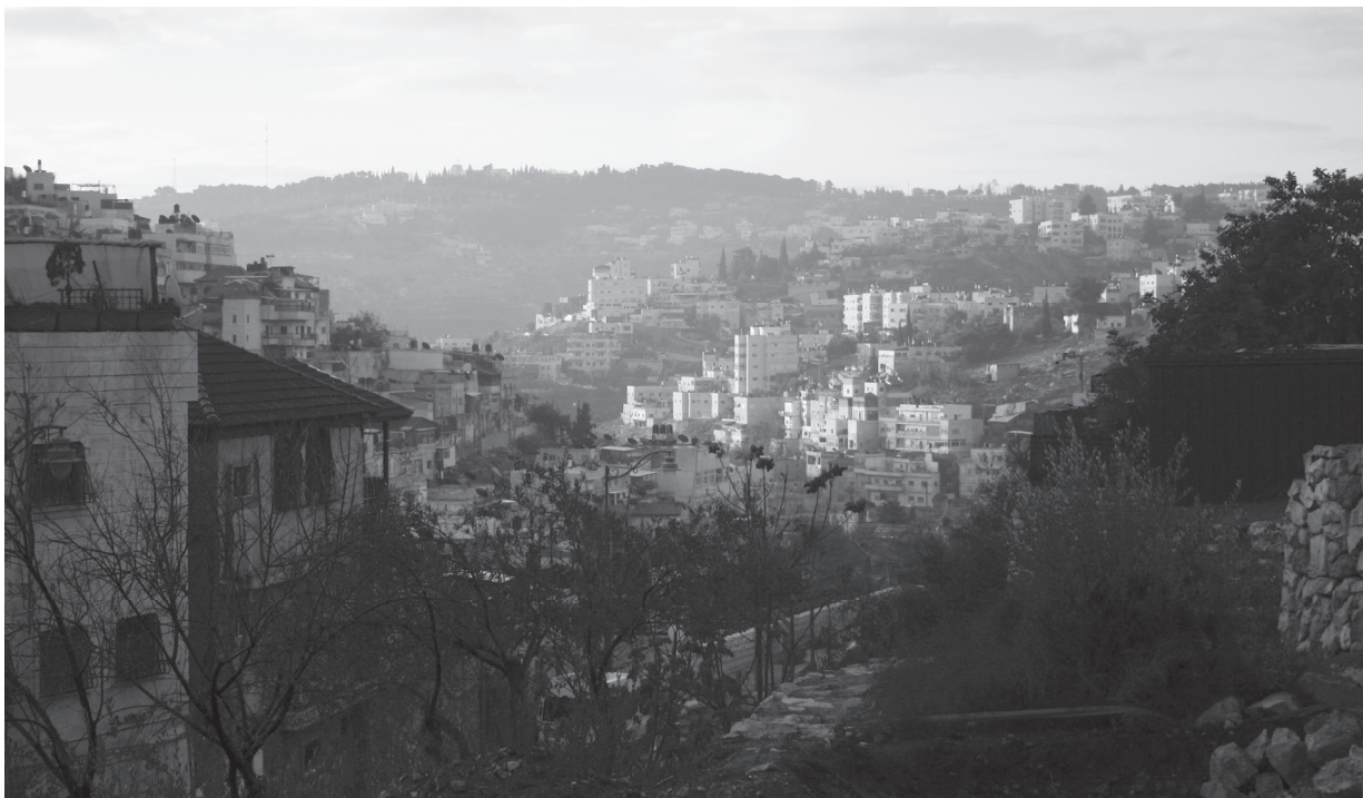
Fig. 1.5: View from the City of David towards the ridge of the British High Commissioner's Residence; the site of Ramat Raḥel lies behind it further to the south.

presence in the landscape and were concerned with its spatial communication with the surrounding settlements—above all Jerusalem, which was the capital city of the Kingdom of Judah, traditional seat of the Judahite monarchs and the site of the Temple.