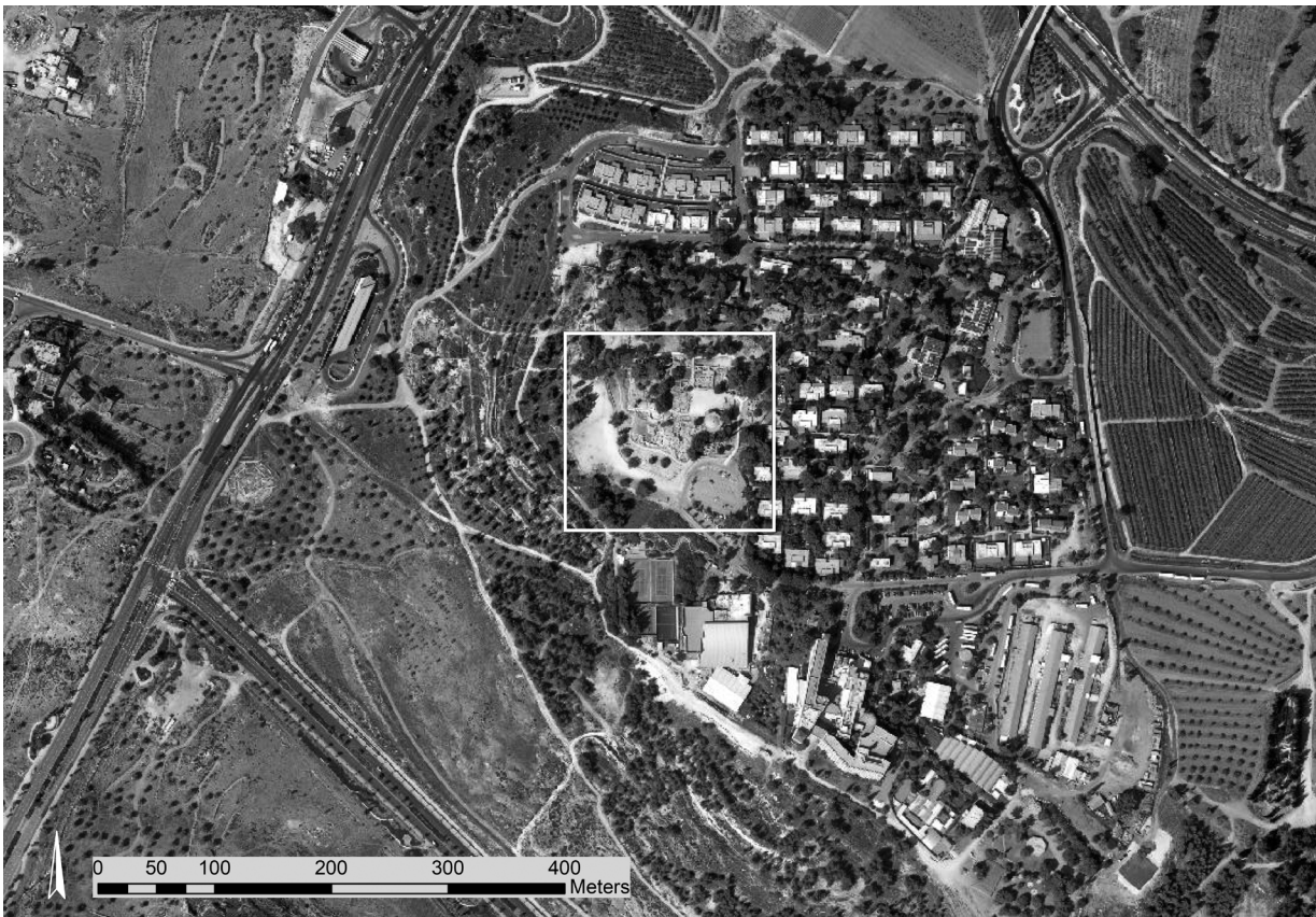
Fig. 1.3: Aerial photo of the site and the nearby kibbutz (courtesy of 'Survey of Israel' 2018. Prepared by Omer Ze'evi).