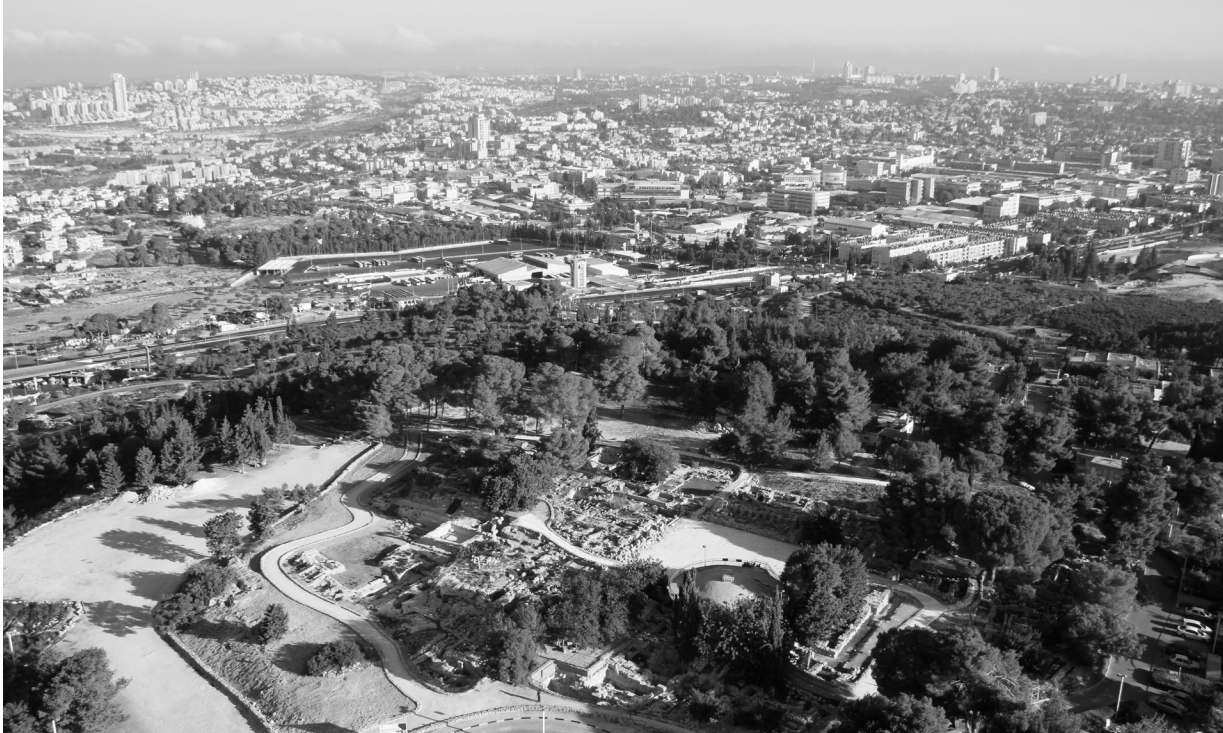
Fig. 1.2: Ramat Raḥel hilltop and the southwestern neighborhoods of Jerusalem.